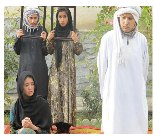
The all-female troupe of White Star Company performs in Kabul.

Theatre in Afghanistan was all but decimated after decades of war and suppression by the Taliban. Bond Street Theatre's ongoing project revitalizes theatre in the provinces, training artists and assisting the creation of all-female theatre troupes to perform for women and girls.