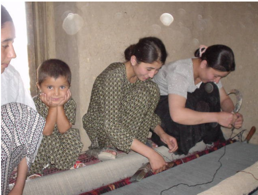
Making rugs in Andkhoi, Afghanistan, at headmaster's home.