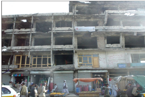
People live in these windowless ruins in Kabul, Afghanistan.

Next year, the group will return to the Balkans to continue collaborating with theatre groups in Albania, Macedonia, Kosovo and Serbia and further develop the Performing Artists for Balkan Peace , a networking project to encourage artistic cooperation in the region.