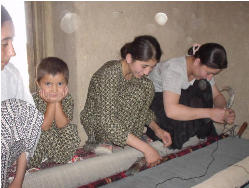
Making rugs in Andkhoi, Afghanistan, at headmaster's home.