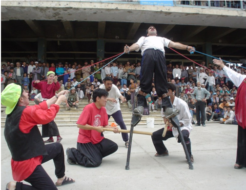
Scene from In the Mirror with Exile Theatre in Afghanistan.