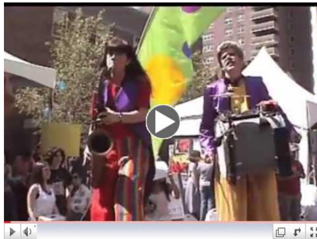
Shinbone Alley Stilt Band

P.S. Check out this fun video of the Shinbone Alley Stilt Band below!